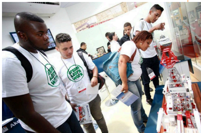
Aker Solutions extended a warm welcome to our students (Macaé)

Current and previous DLW students got to hone their skills when HR experts from Statoil took them through the do's and don'ts of job searching. The event was hosted by Bola Pra Frente.