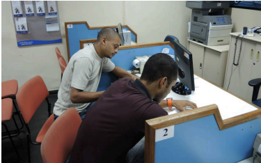
Registering for courses – no time to lose.

DLW initiatives aim to help students better understand their profession and find work. Together with our partners, we arrange different kinds of activities, like job seminars, visits to fairs or school visits by companies.